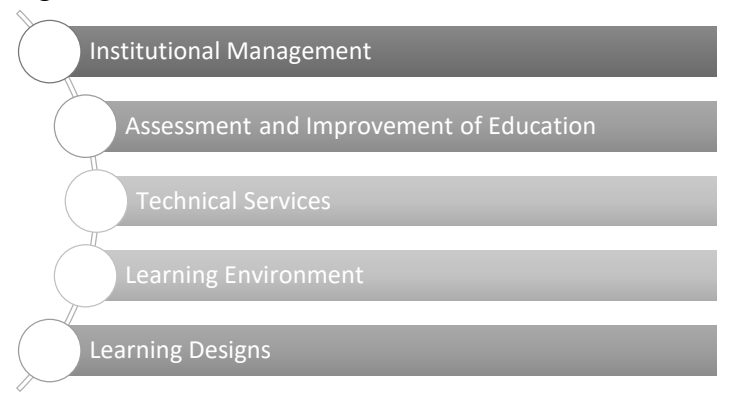
Figure 1: Critical Success Factors in Distance Education

Institutional management includes the decision making processes on distance education actions in all levels, and the management of the entire system. Assessment and improvement of education is determined by the demands of all shareholders of the system. These shareholders are learners, teachers, institutional managers and technical personnel. They all contribute to the processes of assessment and improvement of distance education.